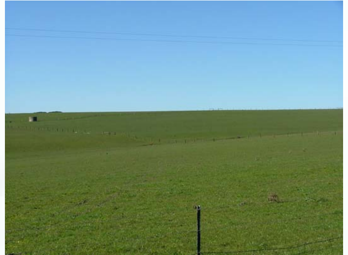
Proposed Site for the Naroghid Wind Farm