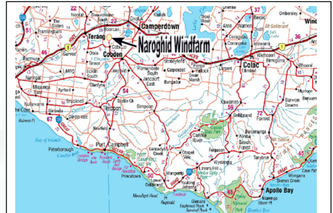
Map of western Victoria showing the location of the proposed Naroghid wind farm.

Each turbine will be up to 125 metres in height to the tip of the blade. The tower and nacelle is expected to be up to 80m high, and the blades up to 40m long.